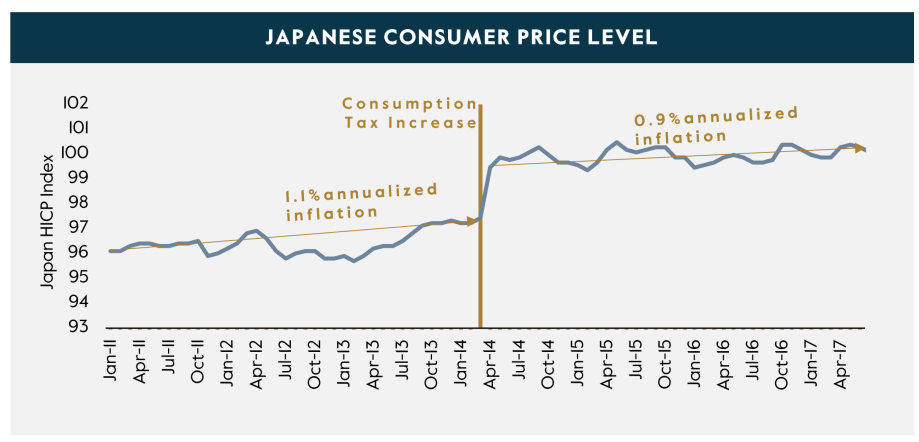
Figure 1: Tax-Related Price Shock Dents Consumption

There is no guarantee any trends will continue.